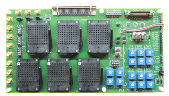
Figure 2. "Flat Stack" Debug Board. The switches at the bottom-right enable quick switching of stackup.