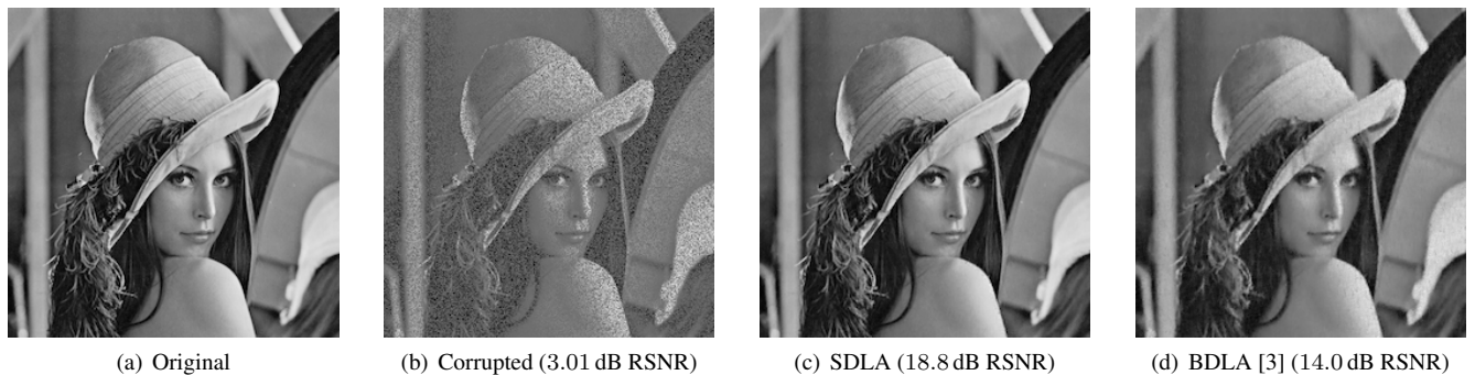
Fig. 2. In-painting results using SDLA and BDLA [3] for an image with 50% missing entries.

to demonstrate that in-painting can be performed with dictionaries learned from the corrupted image itself using SDLA.